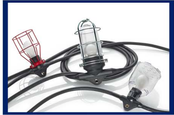
Temporary / Wet-Location Lighting