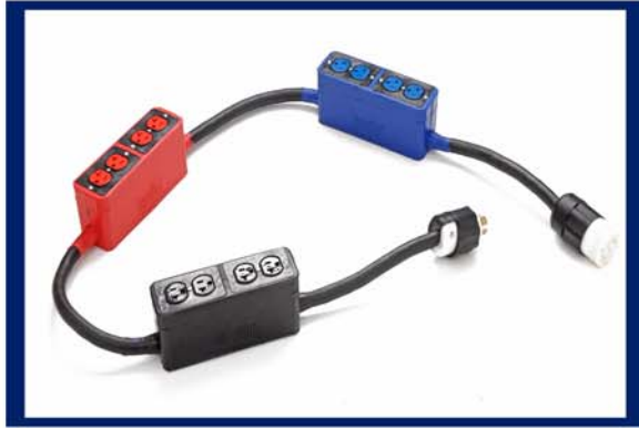
Temporary Power Stringers