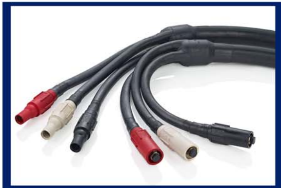
Single-Pole Shore Power Connectors