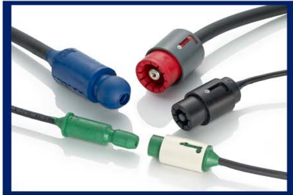
Single / Multi-gang 50-1200 Amp Connectors