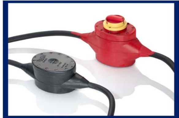
GFCI Distribution Blocks & Safety Switches